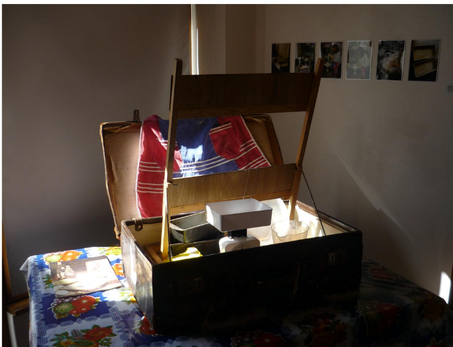
Starter Culture Mobile Installation, 2010 Suitcase, bread making equipment, culture

The starter culture is both a metaphor for the transference and transformation of culture as migration occurs, and a physical substance used by the artists to create a ritual of crossing thresholds. Using grapes from home, the culture is a natural yeast which can be used and re-used, continually changing but also staying intact, retaining some element of its original self. The culture is transported in the bread-making suitcase which also contains tools and equipment to make bread in any place, like the idea of a migrant trying to take everything necessary to recreate home as they travel.