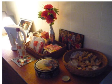
Cabin Fever Installation, 2010 Texts, found objects, photographs, fabric, wood, Dvd player and monitor

Cabin Fever is a reconstruction of the cabin of the Green Cape, where the artists spent 26 days on their journey from Antwerp to Cape Town.