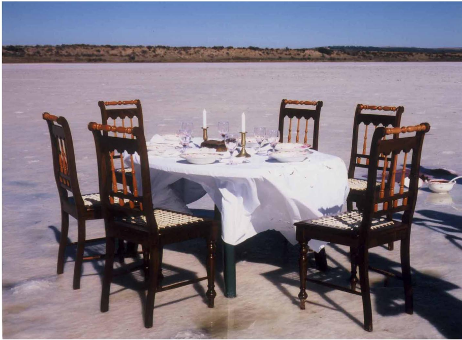
Offere Digital video, 2010

Offere means to bring across, in the sense of an offering, or gift. In this case, the bringing across is an attempt to communicate with ancestors, to find their ghosts in a place they worked. To somehow bridge time, find a window. To leave an offering and hope that somehow it is accepted.